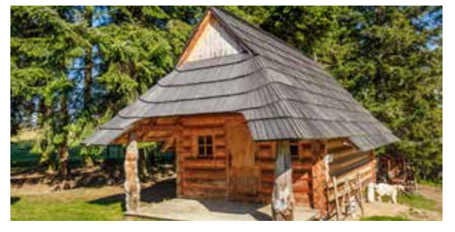
Photo 14. A shepherd's hut – an educational chalet in Łapsze Wyżne (Polish Spiš) with a selection of exhibits on the shepherding tradition.