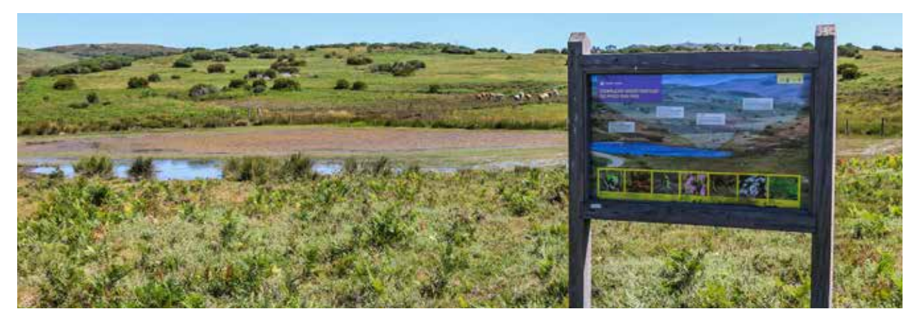
Photo 17. The Peneda-Gerês Park was established 40 years ago to protect endemic species of flora and fauna for educational and scientific purposes, as well as for tourism. The protected zone is open to visitors all year long.