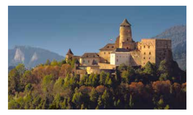
Photo 2. Mediaeval Ľubovňa Castle (14th century) in Stará Ľubovňa (Slovak Spiš) with stunning views of the Pieniny and Tatra Mountains stretching along the Slovak-Polish border.

the human element was "the same" in all areas, and the level of creativity and spirituality of the mountain people was always determined by nature and the experience of life in the mountains. I also found many common intersecting themes: historical, ethnographical, economical, agricultural, and so on.