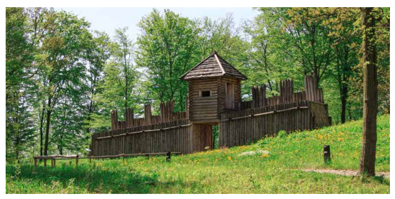
Photo 18. The Carpathian Troy Open-Air Museum was established at the site where one of the oldest gords in Poland had been discovered. Its origins date back to the Early Bronze Age.

The site in Trzcinica, known as "Carpathian Troy", became famous following large-scale archaeological research carried out in the 1990s. More than 160,000 historical artefacts – regarded as examples of ancient art and craft – have been discovered at the site. It was found that the settlement in Trzcinica dated back to the beginnings of Early Bronze Age (2,000 B.C.), thus making it one of the oldest in Poland and in this part of Europe. Trzcinica's similarity to the mythological Troy is mainly of a chronological