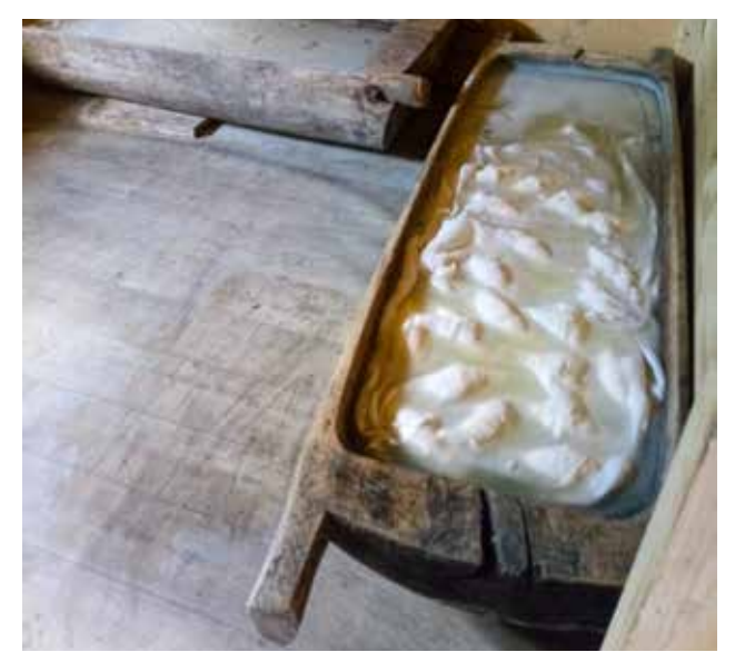
Photo 10. The manufacturing of dairy products such as oscypek, bundz or bryndza cheeses is a tradition that has been cultivated for over 400 years in the Carpathian shepherds' huts.

mating. High biodiversity is a distinguishing feature of these ecosystems.