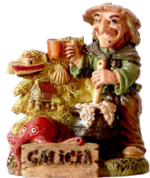
Photo 20. "Meigas", or Galician witches, were not as evil as the "brujas" known throughout Spain – they were also witch-doctors and healers.

Old Celtic legends in which meigas have an important role are popular in Galicia, especially where the witches made a pact with the devil in exchange