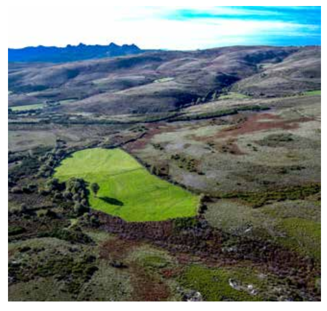
Photo 15. The Serra da Peneda-Gerês Mountains are the northernmost area of Portugal. They are home to the Peneda-Gerês National Park, a UNESCO biosphere reserve.

An interesting initiative in this subject is a project developed in the protected area of the Peneda-Gerês National Park, and more specifically on the beautiful Mourela Plateau in the municipality of Montalegre, in northern Portugal. The landscape is unusual as it depends directly on the interaction between natural and human factors.