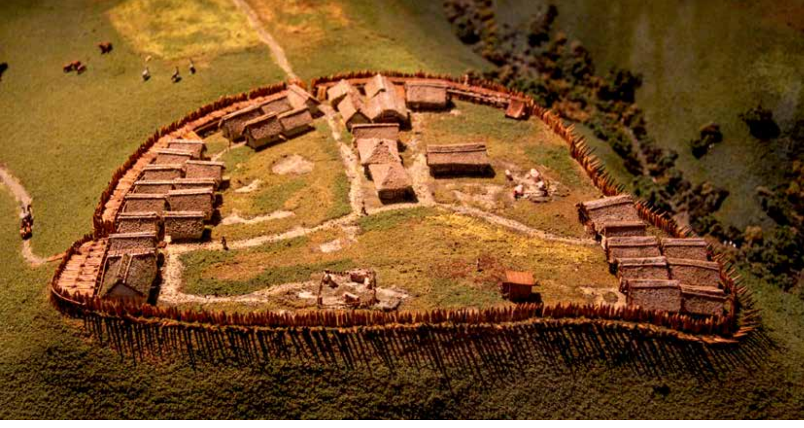
Photo 19. Carpathian Troy is a unique combination of the traditional form of open-air museum and a modern museum facility. The complex consists of the gord's grounds and the archaeological park situated at the foot of the hill.

nature, as the fortified settlement in Trzcinica was founded in more or less the same period as the settlements erected by the Mycenaeans in Greece.