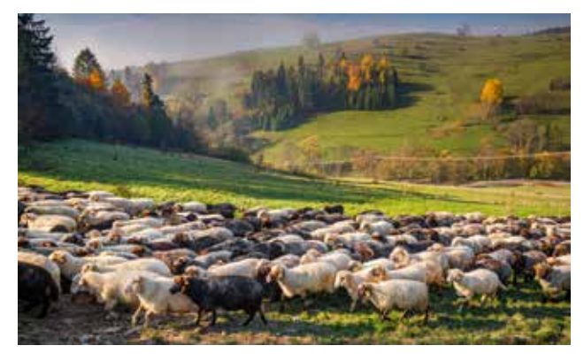
Photo 8. The shepherding of livestock on open pastures in the Carpathian Mountains is a unique form of agricultural activity, not only in terms of animal husbandry but also on account of preserving traditional methods.

Shepherding has been part of the Carpathian landscape for hundreds of years. Highland pastures, forest glades, shepherds' huts – we cannot imagine hiking in the Tatras, Gorce Mountains or the Beskid Sądecki without them.