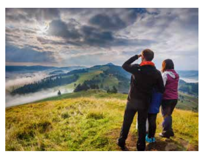
Photo 1. Mountain landscapes are a valuable element of Europe's natural and cultural heritage.

All essays and interviews presented here are an expression of the subjective views of their authors, participants in the CRinMA project.