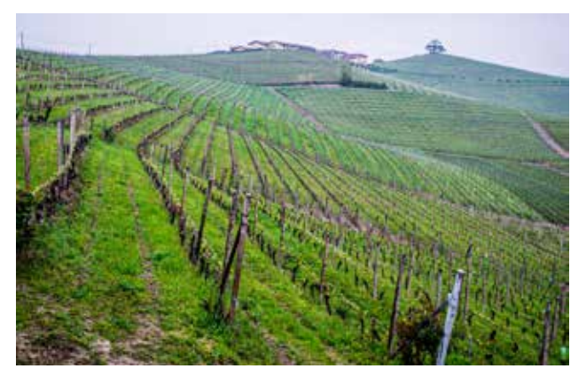
Photo 4. The Langhe Hills with their unique stone terraces, covered in vineyards, are home to some of the best wines in the world (Alta Langa, Piedmont).

Langa stone, Pietra di Langa in Italian, takes its name from the "Alta Langa" (Upper Langhe) region of South Piedmont, featuring beautifully terraced hills, and famed for its fine hazelnuts. The area's unique geological history is due to the presence of this exclusive sandstone, a sedimentary rock made up of grains of sand and marl. It formed during the Miocene, which stretched from 25 to 5.5 million years ago, when the region was beneath a sea known as the "Golfo Padano". At a depth of 700-800 meters below the surface, layers of sand and silt deposits (marl) accumulated, while there was also abundant