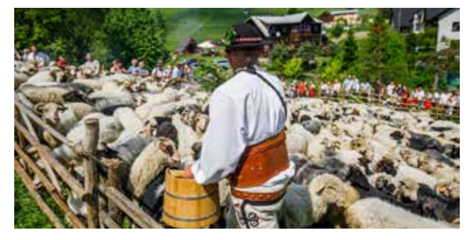
Photo 13. The sheep transhumance and other shepherd events organised on the Wallachian Culture Trail are major tourist attractions, and already have a loyal group of followers.

For more information see the website: szlakwoloski.eu/