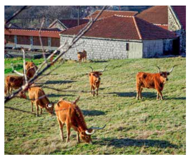
Photo 16. When hiking in the Peneda-Gerês Park there's a chance of meeting some rare animals – the local long-horned Barrosão cattle, bred only in this region.

For more project details see: http://www.europeanheritageawards.eu/winners/sustainable-development-mourela-plateau-peneda-geres-national-park/