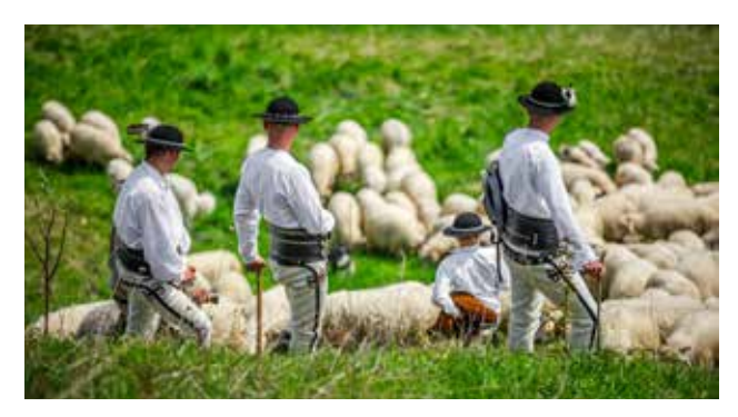
Photo 9. The rich vegetation eaten by the animals on the Podhale meadows contributes hugely to the aroma of the milk, and therefore the quality of the cheese. Ethereal oils present in many endemic plant species find their way into the milk, giving the cheese a natural "seasoning".

Extensive sheep grazing on highland pastures made it possible for plants to create new combinations and a mosaic of species that had adapted to these new habitats. Mountain meadows, which are seminatural plant communities, are full of endemic species, meaning those that occur in one strictly specified place. These areas are specific habitats for animals, which have thereby gained space for feeding and