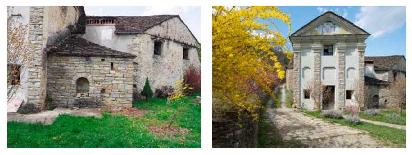
Photos 6 and 7. Over the centuries, Langhe stone became a universal raw material, useful for building houses, farm buildings and churches, as well as for paving streets and demarcating terraces with plots used to this day for vineyards and fruit trees.

Today Langa Stone is a valued building material, entirely natural and aesthetically pleasing, but also exclusive due to the traditional construction methods. It has also become a tourist attraction, bringing in visitors for stone architecture culture trails formed as part of the 11 eco-museums in the region, including in the Bormida, Uzzone and Belbo valleys. Numerous buildings of unique value here have kept their beauty, standing unaltered for many centuries.