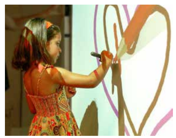
Photos 11 and 12. The digital transformation of the cultural heritage proposed by the Barosso Eco-museum is further proof of how increasingly keen we are on using virtual reality. Visiting the museum becomes an interactive adventure.