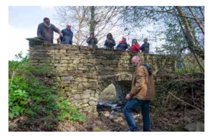
Photo 5. CRinMA project participants during a study visit to the Alta Langa region, where they learned how local stone has been used from Roman times to the present day.

for obtaining the building material. The stone was also sourced from streams and quarry cliffs. When people started to cultivate the land during the Neolithic, stones were an obstacle to agriculture, but later they learned to use them to build terraces.